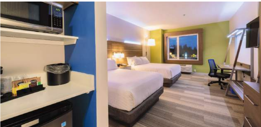
The guest rooms at the Holiday Inn Express showcase the attention to detail Sargent Construction provides