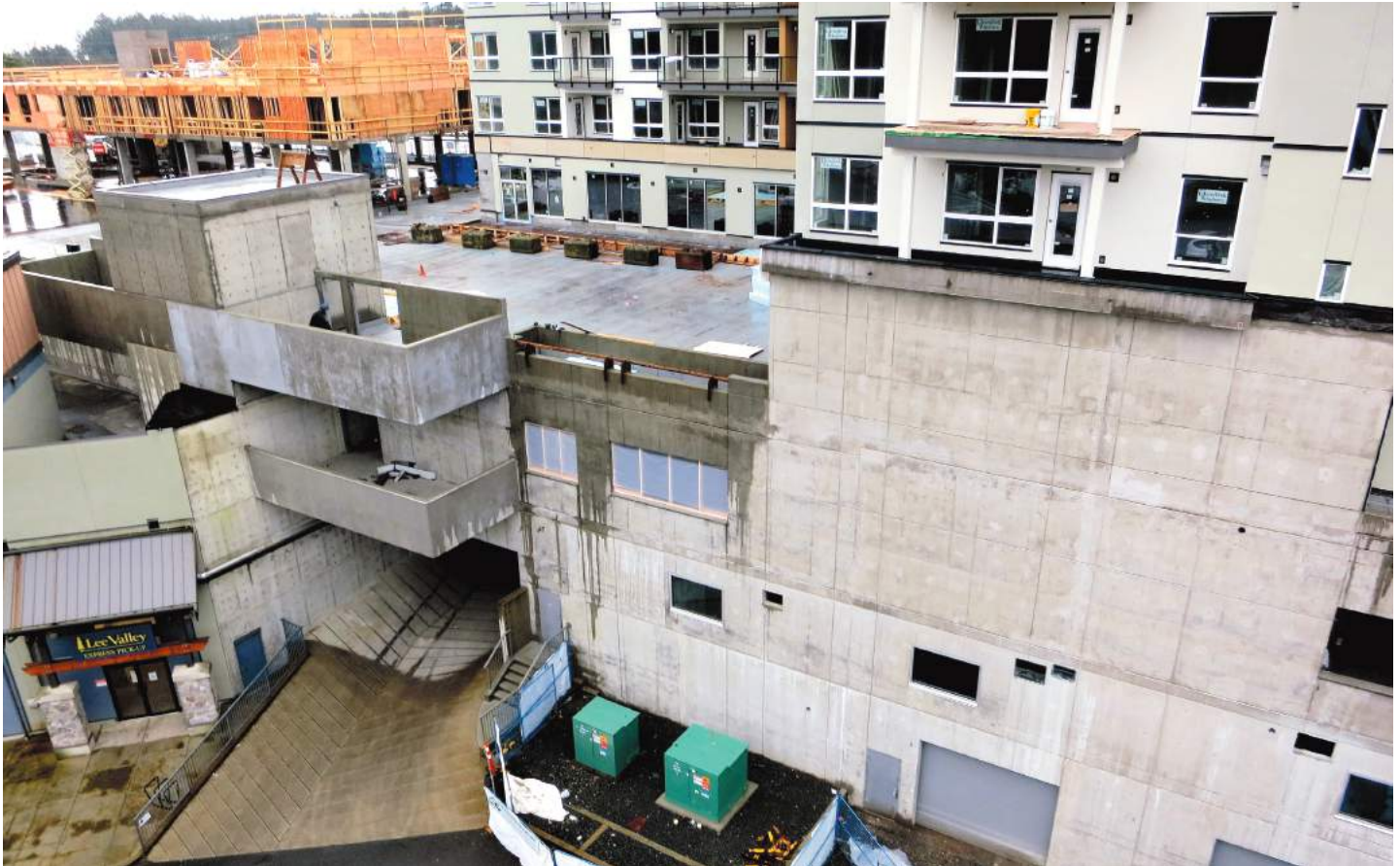
The Westridge Landing mixed use project was another successful Sargent Construction undertaking