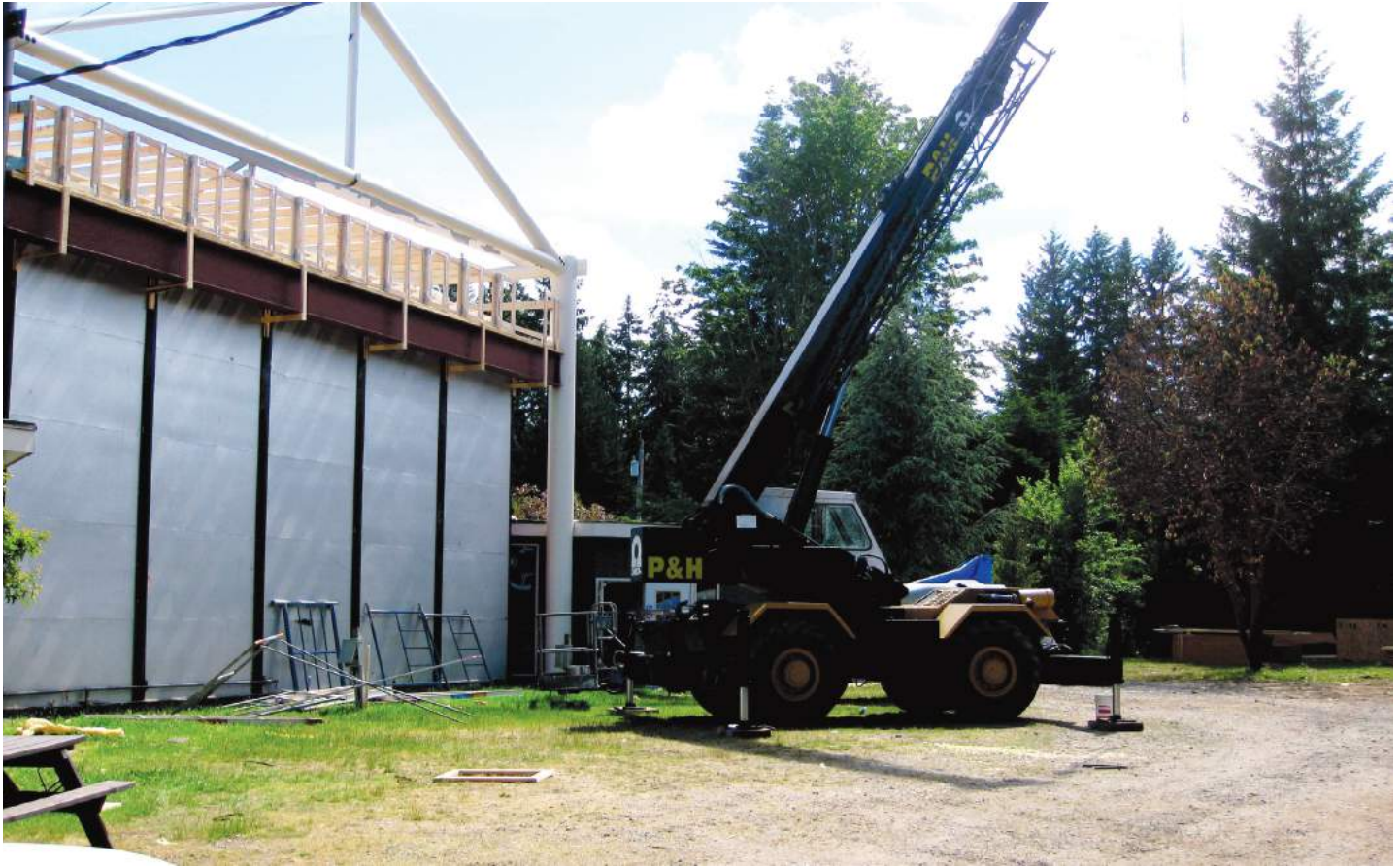
An earlier Sargent assignment involved putting a new roof on the Chemainus Garden Expo pavilion