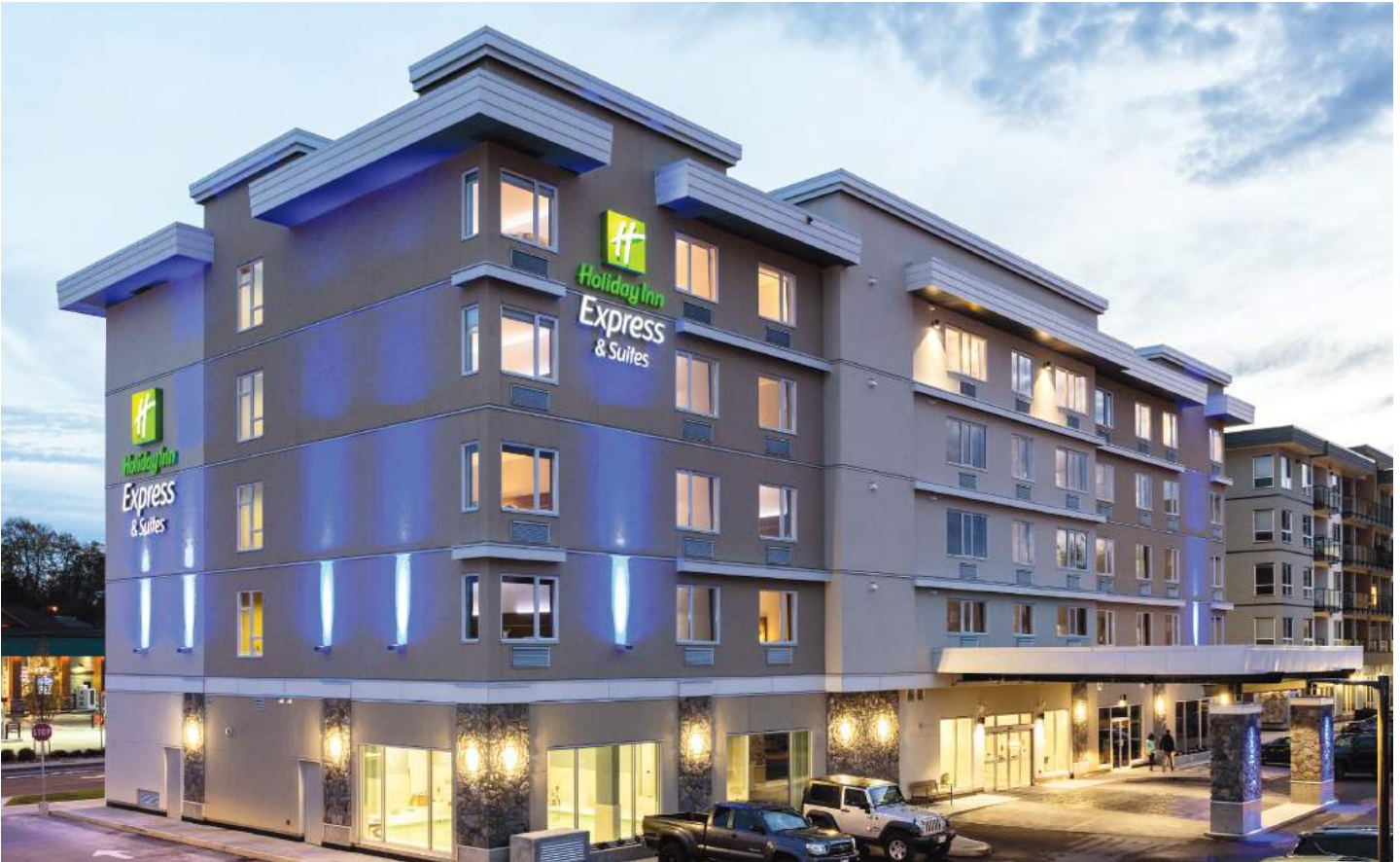
The Holiday Inn Express in Colwood is one of the larger projects completed by Sargent Construction