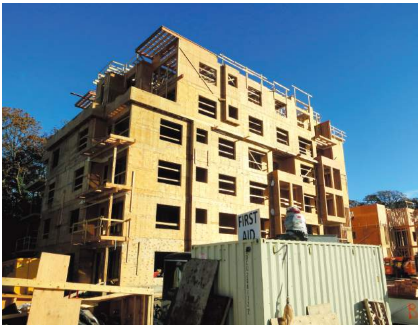
One of the company’s newest projects is a six storey development called The Shire on Inverness