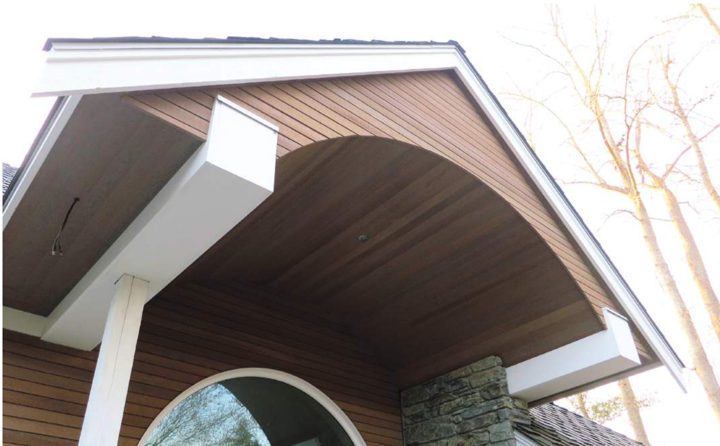
Residential projects also get the Sargent touch, such as this custom house clear cedar entryway