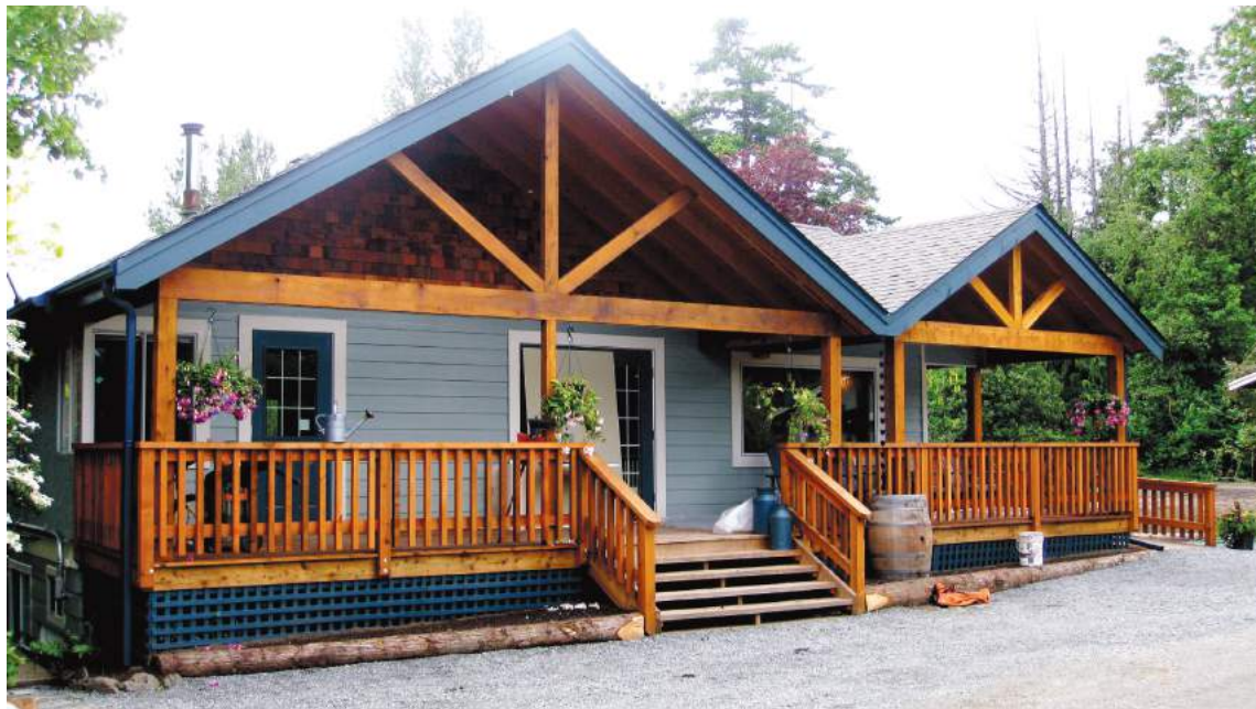
Sargent Construction specializes in new construction and renovations such as this Chemainus Garden Expo office reno